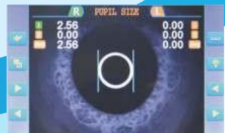
Pupil size measurement

With the pupil size measurement function, which enable to record the pupil size and refraction result in different measurement environment, and provide a reference for the prescription.