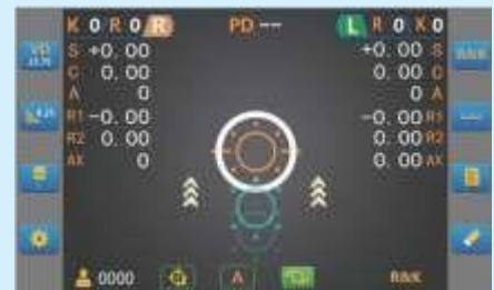
Auto tracking ( Y axis )

The auto tracking function provides the focusing more fast, and reducing the work load sufficiently.